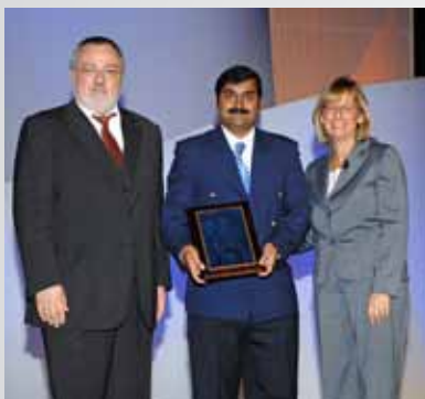
Year 2007 Best Component of the Year Award

We are proud of the Award Winners from our Chapter . . .